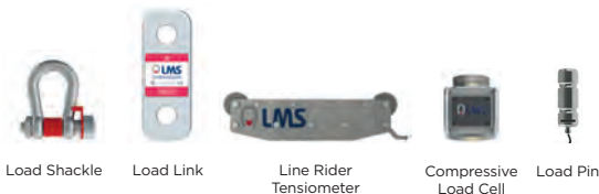
Load Shackle Load Link Line Rider Tensiometer Compressive Load Cell Load Pin