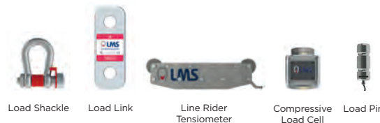
Load Shackle Load Link Line Rider Tensiometer Compressive Load Cell Load Pin